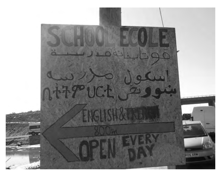
FIGURE 1.1 Directions to L'École Laïque du Chemin des Dunes.

read life stories by people such as Nelson Mandela, Barack Obama and Malala Yousafzai, as well as poetry, and some broader historical, social and philosophical texts. Many also wrote their own full or partial life stories for the course assignment.