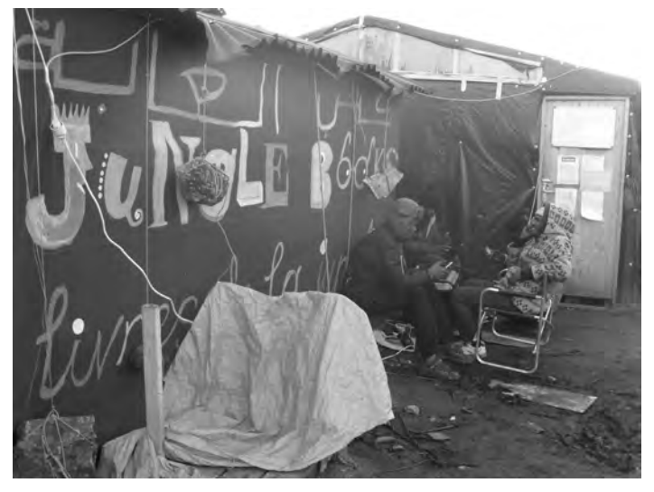
FIGURE 1.2 Outside Jungle Books Library.

of their Life Stories course assignments,<sup>1</sup> and of this book.